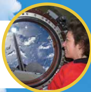
Astronaut Ochoa gazes through the window of the Destiny Lab aboard the ISS, STS-110

Prior to being named center director in 2013, Dr. Ochoa was deputy center director for five years; she previously led the Flight Crew Operations Directorate, managing the Astronaut Office and the Aircraft Operations Division. As the first Hispanic female astronaut, Dr. Ochoa has given hundreds of presentations focusing on the importance of a STEM education. She has six schools named after her, several books written about her, and has been profiled in textbooks and on websites geared toward encouraging females and minorities to pursue technical fields. She is the recipient of many awards including NASA's highest award, the Distinguished Service Medal, the Presidential Distinguished Rank of the Senior Executive Service, three honorary doctorates and is in the Astronaut Hall of Fame. She is a fellow of the American Institute of Aeronautics and Astronautics, the American Association for the Advancement of Science, and the National Academy of Inventors.