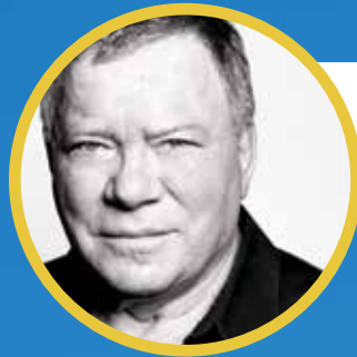
William Shatner Shatner Photo

The RNASA Foundation is pleased to present the 2018 Space Communicator Award to William Shatner.