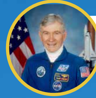
John Young

The RNASA Foundation would like to recognize John Young (1930-2018) for his contributions to the American aerospace program. John was the recipient of the 1997 RNASA Corona Award and the 2000 National Space Trophy.