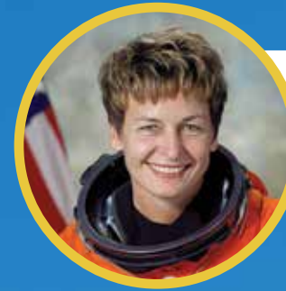
Peggy Whitson

The RNASA Foundation is pleased to welcome Astronaut Peggy Whitson as a stellar awards presenter.