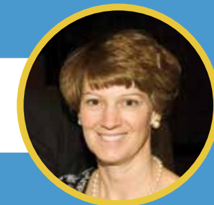
Eileen Collins

COLONEL EILEEN COLLINS, USAF (Ret.) and former NASA astronaut, STS-63, STS-84, STS-93, and STS-114, is a member of the RNASA Board of Advisors who is serving her fourth year on the Stellar Awards Evaluation Panel. She was the recipient of the 2006 National Space Trophy and she received the award as NASA's first female Space Shuttle Pilot and Commander. Collins earned her associate's degree in math/science from Corning Community College in 1976, her BA in math and economics from Syracuse University in 1978, a Master of Science degree in operations research from Stanford University in 1986, and a Master of Arts degree in space systems management from Webster University in 1989. Following graduation, she was a T-38 instructor pilot and a C-141 commander and instructor. From 1986 to 1989, Collins taught math at the USAF Academy in Colorado and was a T-41 instructor. She graduated from the Air Force Test Pilot School at Edwards AFB in 1990 before her selection that year as a pilot astronaut.