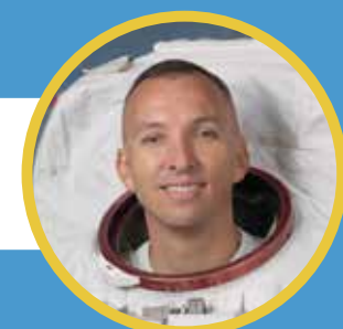
Randy Bresnik

Randy Bresnik spoke at the Stellar Award luncheon at Lakewood Yacht Club earlier today. Bresnik earned a Bachelor of Arts degree in Mathematics from The Citadel in 1989, and later a Master of Science degree in Aviation Systems from the University of Tennessee-Knoxville in 2002. He was designated a Naval Aviator in 1992 and served in three overseas deployments to the Western Pacific. He went on to fly combat missions in support of Operation Southern Watch and Operation Iraqi Freedom. Bresnik was selected for the astronaut program in 2004. A veteran of STS-129, he has also trained as a Cave-a-naut with the European Space Agency to test living deep beneath the Earth's surface as well as an Aquanaut for NASA's Extreme Environment Mission Operation (NEEMO) 19. Bresnik most recently served as the Commander of the International Space Station for Expedition 53 and flight engineer for Expedition 52.