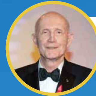
Tom Stafford

Once again, OMEGA has generously donated a watch to the recipient of the National Space Trophy. The watch is presented by Lt. Gen. Thomas P. Stafford, USAF (Ret.), the recipient of the Trophy in 1993, and a member of