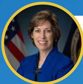
Dr. Ellen Ochoa

Dr. Ellen Ochoa, Director of the Johnson Space Center and veteran NASA astronaut (STS-56, STS-66, STS-96, and STS-110), will present the prestigious 2018 Rotary National Award for Space Achievement to NASA Acting Administrator Robert Lightfoot.