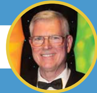
Michael Coats

MICHAEL COATS is a member of the RNASA Board of Advisors and is serving his third year on the Stellar Award Evaluation panel. The former astronaut and former NASA Johnson Space Center Director received the 2012 National Space Trophy. Coats received his B.S. degree from the Naval Academy in 1968 and went on to earn his pilot's wings the very next year. He flew 315 combat missions in Southeast Asia from the USS Kitty Hawk from 1970 to 1972. Following test pilot training in 1974, he was project officer and test pilot for A-7 aircraft until selection as a flight instructor at the U.S. Naval Test Pilot School in 1976. He was selected as an astronaut in 1978 and piloted STS 41D in 1984, the maiden flight of Discovery. He went on to command STS-29 and STS-39. Between 1991 and 2005, Coats worked for Loral Space Information Systems, Lockheed Martin Missiles and Space and Lockheed Martin Space Systems. He was the Director of JSC from 2005 until 2012. Under his leadership, JSC implemented over 80 partnerships and hosted summits and job fairs to help displaced workers. To help NASA attract and retain future leaders, Coats instituted the Program Project Management Development, the Space Systems Engineering Development, and the Project Leadership programs. He was inducted into the Astronaut Hall of Fame in 2007. He is now the proud full-time "Pops" to three adorable and perfect granddaughters.