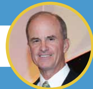
Kevin Chilton

GENERAL KEVIN CHILTON is a member of the RNASA Board of Advisors who is serving his fourth year on the Stellar Award Evaluation panel. He was the recipient of the 2011 National Space Trophy. A graduate of the U.S. Air Force (USAF) Pilot Training and Test Pilot Schools, Chilton holds a BS in engineering science from the USAF Academy and an MS in mechanical engineering from Columbia University. He was selected as an astronaut in 1987. Chilton piloted STS-49 and STS-59 and commanded STS-76 in 1996. He served as deputy program manager for the ISS until leaving NASA in 1998. From 2007 to 2011, he commanded the U.S. Strategic Command overseeing operations for all U.S. forces conducting strategic deterrence and the Department of Defense's space and cyberspace operations. He retired from the Air Force in 2011 and now serves as a Director of Orbital ATK and CenturyLink Corporations.