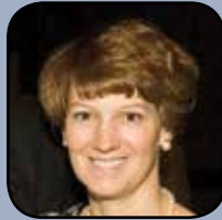
Col. Eileen Collins

Colonel Eileen Collins , USAF (Ret.) and former NASA astronaut, STS-63, STS-84, STS-93, and STS-114, is a member of the RNASA Board of Advisors who is serving her second year on the Stellar Awards Evaluation Panel. She was the recipient of the 2006 National Space Trophy and she received the award as NASA's first female Space Shuttle Pilot and Commander.