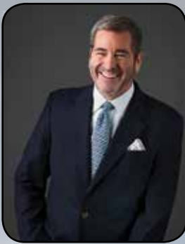
Miles O'Brien

The Rotary National Award for Space Achievement Foundation (RNASA) is thrilled to welcome broadcast news veteran Miles O'Brien as Emcee for the 30th annual awards gala. O'Brien suffered a terrible accident in 2014 when a large television equipment case fell on his left forearm, forcing doctors to amputate just above his elbow. His strength and resilience during the healing process is an inspiration to us all.