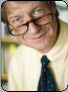
P.J. O'Rourke

The Rotary National Award for Space Achievement Foundation (RNASA) is pleased to welcome P.J. O'Rourke, journalist and American political satirist, as the RNASA's featured speaker of the 30th annual awards banquet.