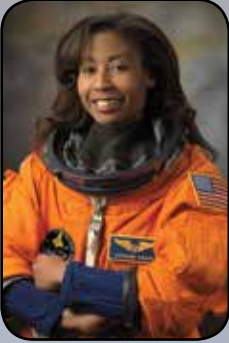
Stephanie Wilson

The RNASA Foundation is pleased to have Astronaut Stephanie Wilson present the Stellar Awards this year. She is a veteran of three flights aboard the Space Shuttle Discovery.