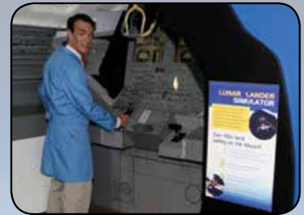
Bill’s Climate Lab at the Chabot Space and Science Center Oakland, CA

Nye’s first book for a general audience, “Undeniable – Evolution and the Science of Creation,” was featured on the New York Times’ Bestsellers List. Nye’s most recent book, “Unstoppable-- Harnessing Science to Change the World,” takes on the subjects of energy and climate change. He met with President Obama in 2015 and has appeared on Larry King Live to speak out about the effects of global warming.