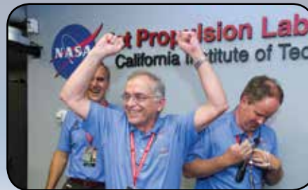
A jubilant Director of the Jet Propulsion Lab after the landing of the Curiosity rover on Mars, August 5, 2012