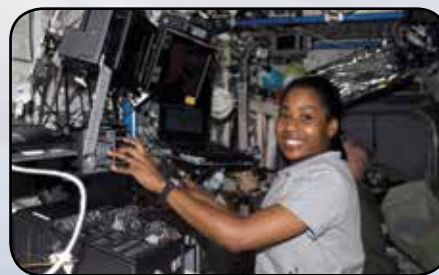
Astronaut Stephanie D. Wilson, STS-121 mission specialist, works with the Mobile Service System (MSS) and Canadarm2 controls in the Destiny laboratory of the International Space Station.

The Leonardo MPLM — now permanently installed on the ISS — carried more than 6,000 pounds of hardware and science supplies on this mission, including the