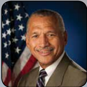
Charles Bolden Jr.

The RNAS Foundation is honored to have NASA Administrator Charles Bolden Jr., as the 2016 National Space Trophy Presenter. Mr. Bolden was the recipient of the National Space Trophy in 2014.